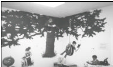
Savonburg's Children's Area

📖 You've seen the tree that's growing in Oswego. Trees are popular in our libraries.