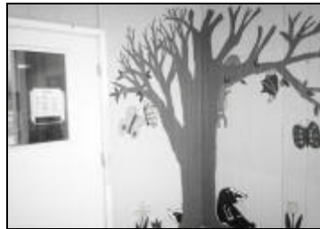
Moran's Cheery Entrance

📖 Moran Library's tree greets you before you enter the door.