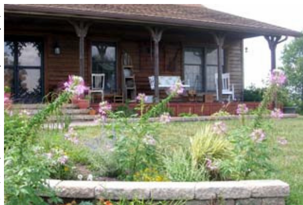
Cedar Crest Lodge, near Pleasanton, is the site for APPLE training, May 19-20, 2010.

The first year's Core will be held at Cedar Crest Lodge near Pleasanton on May 19-20.