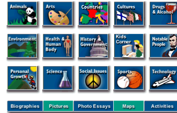
Subject Search Screen

“Spotlight of the Month” collects articles by theme. A link to Article of the Month Archive links